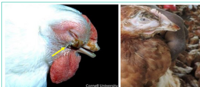
Figure 1: Watery eyes, Conjunctivitis, infra orbital sinusitis/swelling.