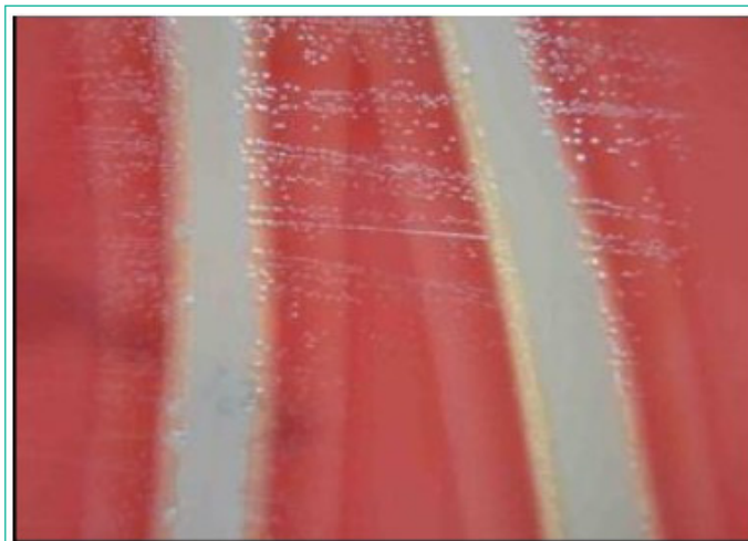
Figure 3: Blood Tryptose Agar (BTA) plate cross streaked with Staphylococcus aureus feeder.

bacterial and viral pathogens [37,48]. Given its slow growth rate and a need for specialized laboratory media and conditions, the organism is difficult to detect by culture, particularly from sites colonized by normal flora [9]. The minimal and maximal temperatures for the growth of the bacterium are 37 and 38°C. It is able to produce acid from maltose, mannitol, sorbitol and sucrose [12].