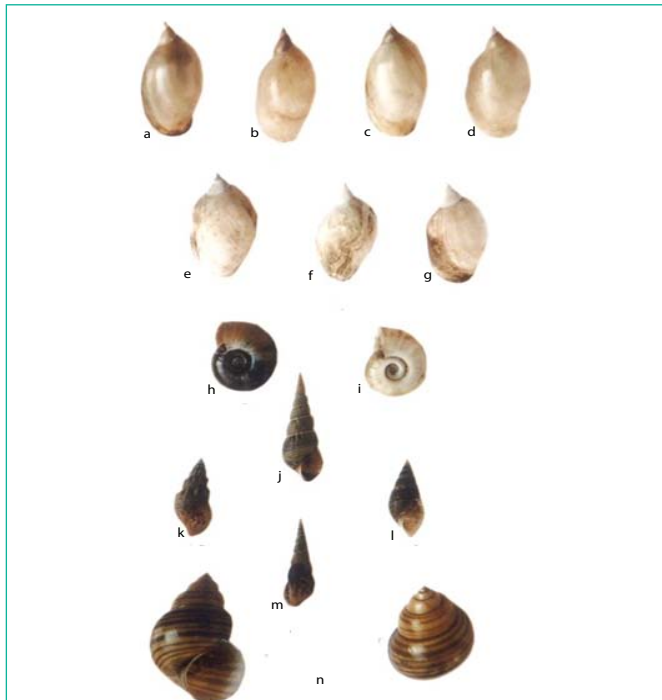
Figure 1: The most common freshwater vector snail species. Lymnaea acuminata f. patula (Figure a), L. acuminata f. chlamys (Figure b), L. acuminata f. typica (Figure c), L. acuminata f. rufescens (Figure d), L. luteola f. australis (Figure e), L. luteola f. typical (Figure f), L. luteola f. impure (Figure g), Planorbis ( Indoplanorbis ) exustus (Figure h), Faunus ater (Figure i), Melania ( Plotia ) scabra (Figure j), Thiara ( Tarebia ) lineate (Figure k), Melanooides striatella tuberculata (Figure l), Vivipara bengalensis race gigantica (Figure m) and V. bengalensis race mandiensis (Figure n).

of overpopulation. But it can also lead to population imbalance. During the evolution, a unique kind of biological castration process is evolved in many species of invertebrate animals which is natural and performed by a small organism, parasite (castrator). Due to physical presence of a parasite causes partial or complete removal of gonads from the host animal or inhibition of gametogenesis and output of reproduction [44]. This biological process is generally known as “parasitic castration”. In fact, parasitic castration is an infectious strategy that requires the eventual intensity-independent elimination of host reproduction as the primary means of acquiring energy [45]. In other words, a single individual parasitic castrator will prevent or block host reproduction when the parasite matures. Such type of parasitic castration is commonly found in most of the fast breeder aquatic animals such as gastropod molluscs or snails [46-54], bivalves [55-57] and number of crustaceans and other invertebrate animals [58-60]. Interesting, besides the sterilization of snail host, parasitic castration also induces the growth of young snail host called gigantism [58,61], sex reversal [62] and potential to alter the gene expression in brain of the snail host also [63].