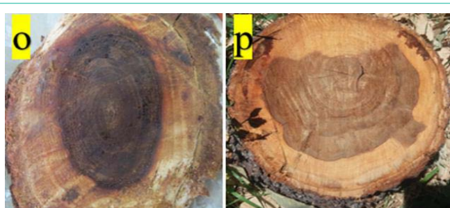
Figure 3: o-p: Dark brown to black discoloration of the wood in the central core of the branch and trunk on elm trees.

Recently, the epidemiological assessment of wetwood disease has been carried out with Geographic Information System (GIS) in the different regions of Tabriz. Thereby, the results showed that the wetwood disease has out broken in the most of elm trees and it was prevalent in 80 percent of Tabriz city areas [20].