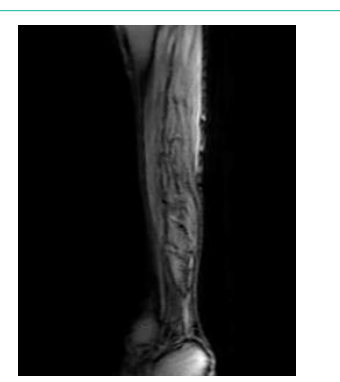
Figure 2: MRI: a mixed signal mass behind the tibia and fibula in the middle and lower segment of the left leg, which was accompanied by calcification and hemorrhage.