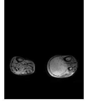
Figure 1: CT: The left shank muscle occupied a space with a size of about 96×57×59 mm, with scattered calcification and unclear boundary.