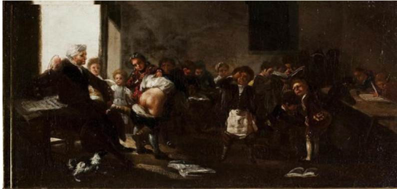
Figure 3: La letra con sangre entra or Escena de escuela . Fuente: Autor Francisco de Goya. La letra con sangre entra o Escena de escuela . 19,7 x 38,7 cm. Óleo sobre lienzo. Museo de Zaragoza (adquirido por el Gobierno de Aragón en 2008 a la Galería Caylus).

scientific medicine; the prescription . There are many examples: medical treatment for children with hyperactivity, desestresores 1 with vitamins for this fleeting world, medicines for controlling overweight and obesity, anxiety, depression or banishment treated with anxiolytics, in the pursuit of perfection of the body, the pursuit of perfection of the body, because of fashion stereotypes, they give plastic surgery, etc. In this way it exists in a nirvanic epic and unequalled state, where hours pass between prescriptions and diagnostic hypotheses, which generate part of their selves. In this live where the services provided are given by a Company, which makes you forget the solitude of our being, establishing us as a raw material of a health system that leads to a short scientific sigh controlled all its slopes.