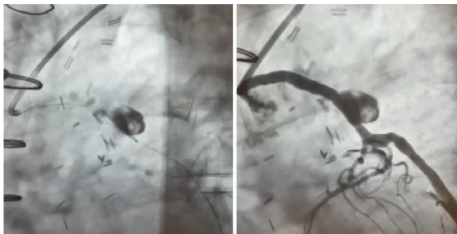
Figure 3: Angioplasty with covered stent (arrow), good flow to the large supplying territory of vein graft compared to before procedure (Figure 1).

time, the best route for revascularization was undecided. We focused on rate control with atenolol up-titrated to 100mg and kept patient on apixaban for thrombotic event prevention. After one month of follow-up, the patient still had chest pain and dyspnea on exertion. Transesophageal Echocardiography (TEE) showed moderate mitral valve regurgitation (Figure 2).