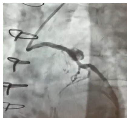
Figure 1: Angiogram shows contained spontaneous vein graft rupture.

Ventriculography showed a left ventricle ejection fraction of 40%. The patient also has moderate to severe mitral regurgitation. At that