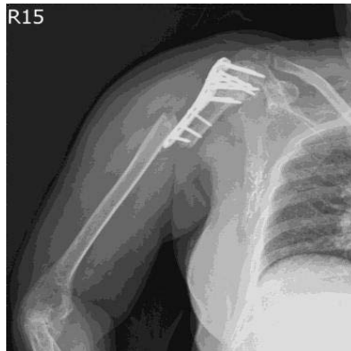
Figure 3: Radiograph of the right upper arm showing a peri-implant humeral shaft fracture at the junction of the proximal and middle third. Note the loosening of the most distal screw but retention of the overall prosthesis from the initial surgery.