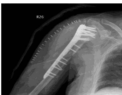
Figure 4: Postoperative radiograph after the salvage procedure showing good reduction and fixation with the stacked plates and screws.

of the plate and screws as not to injure the radial nerve.