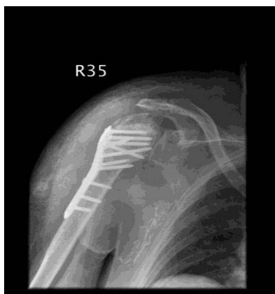
Figure 2: Postoperative radiograph showing fixation with a locking proximal humeral plate and bone grafts in the treatment of the aforementioned fracture.