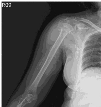
Figure 1: Radiograph of the right upper arm showing a four-part proximal humerus fracture. Note the surgical clips in the axillary region that remain from her previous breast surgery.