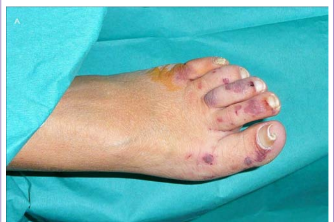
Panel A: Purpuric rash involving the toes of the left foot with mild peripheral cyanosis.

A 42-years-old stage V CKD female patient presented with a sudden purpuric rash involving the left knee and the toes of her left foot (Panel A). She also reported mild paresthesias and mild pain in the anterior thigh. When compared with the other foot a slight reduction in temperature and mild peripheral cyanosis were evident. The patient had recently undergone surgical thrombectomy of a thrombosed graft previously placed on her left thigh. Acute ischemia of the territory supplied by the popliteal and posterior tibial arteries was ruled out by Doppler ultrasound. Aorto-iliac CT-angiography showed an embolus (Panel B, arrowhead) partially occluding the lumen of the left femoral artery (Panel B, arrow) just below the anastomosis to the vascular graft. All complaints and physical signs resolved spontaneously over the next 15 days with the skin lesions being replaced by a post-inflammatory hyperpigmentation.