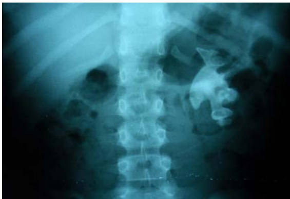
Figure 1: X-ray showing a staghorn calculus in the left kidney.