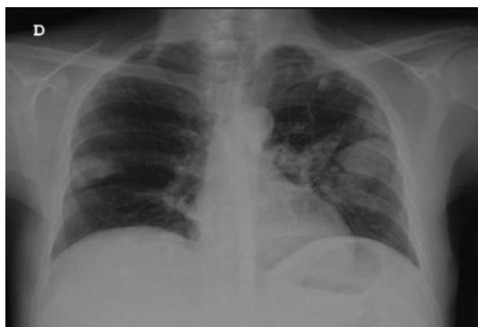
Figure 1: Chest X-ray in posteroanterior view showing confluent bilateral opacities more evident on the left lung.

This is the case of a 64-year-old man, on renal replacement therapy since 2008, due to autosomal dominant polycystic kidney disease. The patient was on peritoneal dialysis from 2008 to 2016, when he underwent renal transplantation. Transplant duration was less than a month due to acute vascular rejection. Since then, he is on hemodialysis. A few months after transplantation, it was incidentally identified confluent bilateral opacities, more prominent