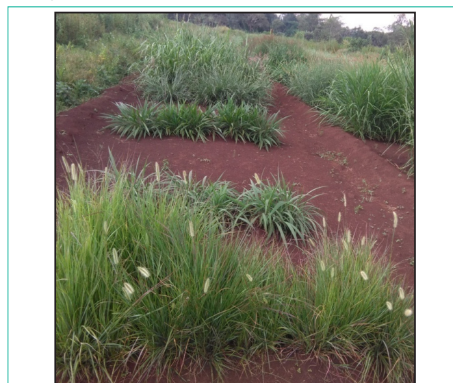
Figure 4: Pictorial of grass landraces during characterization and evaluation.

Number of primary branches per plant, number of Secondary branches per plant and length of the primary branches were measured and different among the grass landraces (Table 2). Higher number of primary branches was obtained from accession NG-0114 (120) followed by NG-0127 and NG-00117 (106), whereas lower number of primary branches was obtained from NG-0097 (8) and NG-0093 (9), respectively. Higher number of secondary branches was nine (9) recorded from both NG-0054 and NG-0098. This showed that grasses had more primary branches than secondary branches. The maximum length of primary branches of the collected grass landraces measured from NG-0051 (283.2 cm) followed by NG-0054 (259.8 cm) whereas lower length was measured from NG-0126 (15 cm). The difference of branch characteristics of landraces is due to the species discrepancies of the grasses.