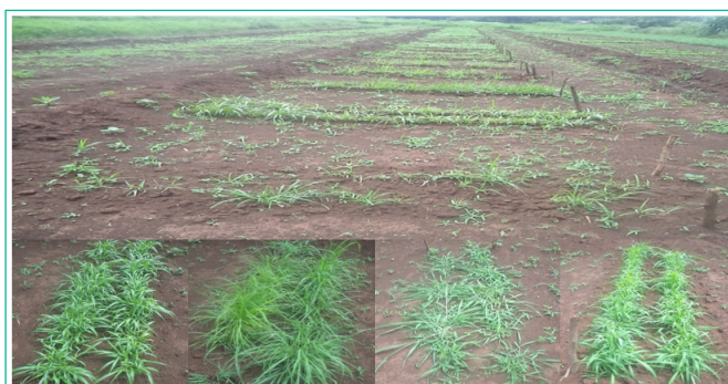
Figure 1: Grass landrace seed emergence.

According to local farmers' testimony and firsthand experience with the forages, the collected landraces are native, natural forages that animals most likely eat and love. The genetic forage materials were gathered from protected locations including mountains, natural forests, and protected areas like schools, churches, and enclosure areas. Forage grasses were assigned an accession number during the collection period, and local names, elevations, and life span (longevity) of the forages were noted. Perennial forages predominated among the grass landraces that were collected as opposed to annual plants. The forage collection sites were spread over lowland and midland agro ecologies.