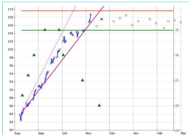
Figure 1: Figure 1 illustrates weight gain and maintenance for an anorexia nervosa patient in the Partial Hospitalization Program (PHP). The circles represent weight on days of PHP with connected lines representing contiguous days of treatment. Spaces early in treatment reflect weekends and later denote outpatient meetings after discharge from PHP. The goal weight range for this patient is represented by the two parallel lines at 104 lbs. and 109 lbs. respectively. The triangles are Calorie levels as seen on the right vertical axis.

examples of weight charts like the one in Figure 1 which shows this steady and predictable increase in weight followed by maintenance in the goal weight range. It is both surprising and reassuring to many patients how rapidly metabolic rate is boosted in response to increases in Calories prescribed [25] (see triangles in Figure 1). Patients are encouraged to view food as “medication” and the “dosage” is designed to increase metabolic rate while creating predicable weight gain. If weight gain is not the main goal of treatment, then the Calories are adjusted to maintain a stable body weight that is consistent with the patient’s genetic and/or biological predisposition and this can be expected to lead to a marked decline in disturbed eating patterns, as well as emotional and cognitive symptoms. It is our assumption that normalization of body weight is absolutely required to promote “healing” from the ravages of chaotic eating patterns and chronic starvation/dieting.