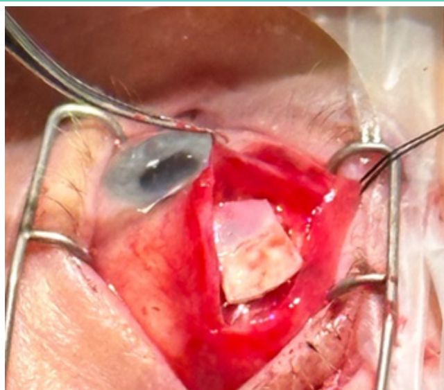
Figure 1: Surgical implantation of corneoscleral patch graft.

transparency, permission of visibility of underlying tube, low cost, and relatively good availability. Lam et al described use of corneoscleral patch grafts for Ahmed glaucoma valve implantation in patients with refractory and complicated glaucoma (sixteen consecutive patients). At a mean follow up of 6 months, they found no complications related to the corneoscleral patch, with corneal portion of the graft remaining transparent with good visualization of the underlying silicone tube [3]. The benefits of purely corneal donor tissue (including partial thickness corneal patch grafts) have also been described in the literature [4].