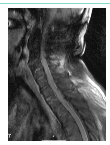
Figure 5: Sagittal View of Thoracic MRI (Fat Supression).

This type of injury is almost always seen at thoracolumbar region [2]. It is very rare at thoracic region because of the protective effect