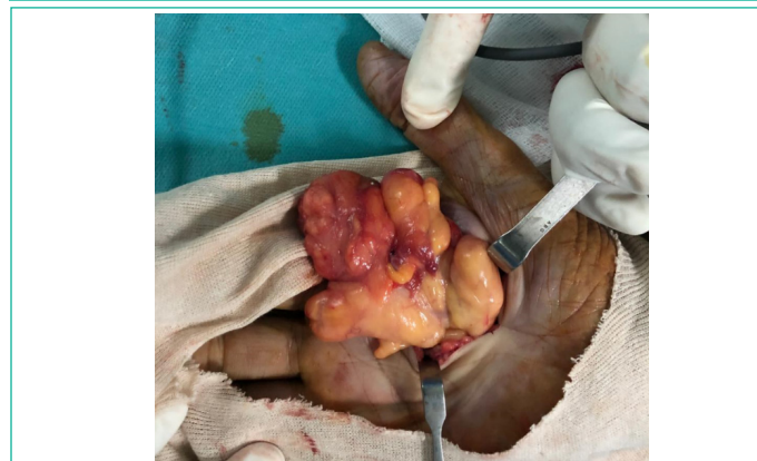
Figure 8: Macroscopic view of the giant arborescent lipoma during excision.