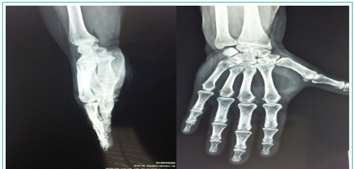
Figure 2: X-ray of the hand showed opacity of the soft parts of the thenar compartment.

The MRI (Figure 3) revealed a giant lipoma in the thenar eminence measuring 5.4cm×2.4cm×4.6 cm, extending into the carpal tunnel and compressing the flexor tendons and the median nerve.