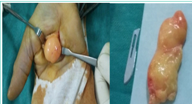
Figure 4: Intraoperative aspect of giant lipoma.

The macroscopic examination of the excised specimen (11cm×08cm×2.5cm) describes a benign lipoma with a homogeneous yellowish fatty appearance (Figure 9). Furthermore, microscopic analysis confirmed the diagnosis of a benign conventional lipoma without cellular atypia.