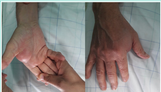
Figure 5: Clinical Aspect of the Thenar Mass in the Right Hand.