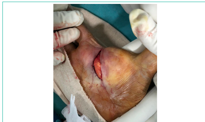
Figure 7: Incision along the thumb opposition crease.