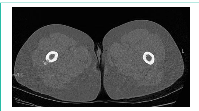
Figure 3: Axial view MRI Non contrast.