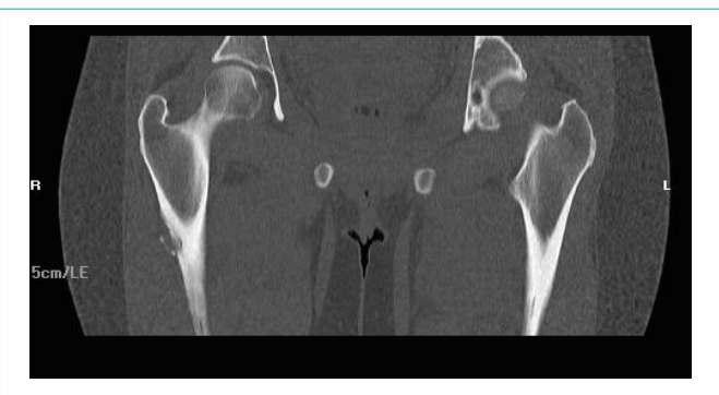
Figure 7: Coronal view MRI Non contrast.