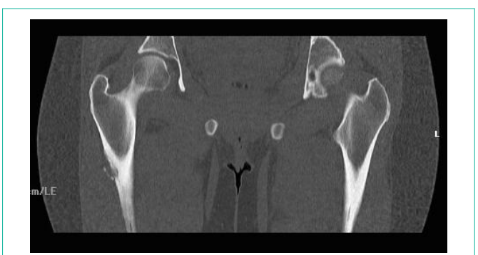
Figure 4: Coronal view MRI Non contrast.