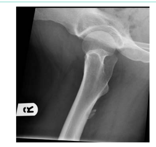
Figure 1: Lateral View Radiograph.

femur, CT scan showed cortical defect in the femur (lytic lesion), MRI revealed bone and soft tissue oedema, IV Gadolinium revealed increased signal within marrow and periosteum and bone scan