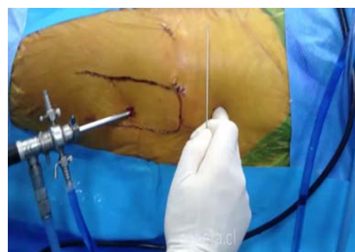
Figure 1B: The superior portal is performed, first by inserting a needle guide.

A 70° optic camera is used through the lower portal, crossing the fascia lata in this step to enter in the peritrochanteric space. Once inside, we proceed to infiltrate the space with saline solution to distend it. After this, the superior portal is performed, first by inserting a needle guide until it is visible (Figure 1B), and second by expanding the portal with the dilators and introducing a non aggressive shaver and electro-surgical system to clean the peritrochanteric space [5,6].