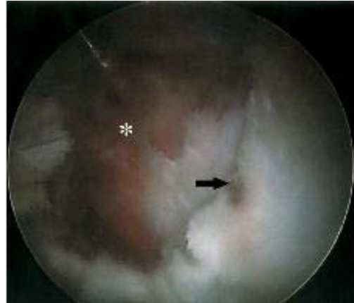
Figure 4: Gluteus medius injury identification.

Diagnoses of these pathologies are clinical, using imaging, typically high resolution hip Magnetic Resonance Imaging (MRI) of the hip. Gluteus medius and minimus injuries, and bursitis share common symptoms of pain in the lateral aspect of the hip, with pain radiating towards the lateral thigh, and into an ill-defined posterior gluteal zone [7,8]. An important clinical difference of gluteus medius injuries, where the insufficiency to stand monopodal, produces a Trendelenburg gait after a few seconds of being in this position (20-30 sec).