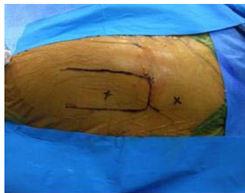
Figure 1A: Peritrochanteric portals.

If the procedure is associated with arthroscopy of the medial compartment, we place the patient in supine position over an orthopedic traction table, but without traction; if not, we place the patient over an operating radio lucid table; so the greater trochanter is identified, and we use the mid-superior and mid-inferior peritrochanteric portals (Figure 1A) [4].