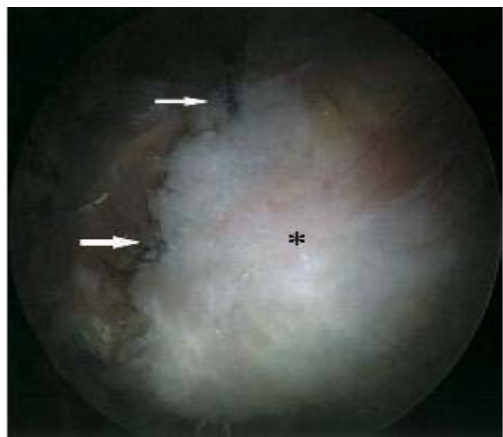
Figure 5: Gluteus medius fixing with suture with two-track anchors.