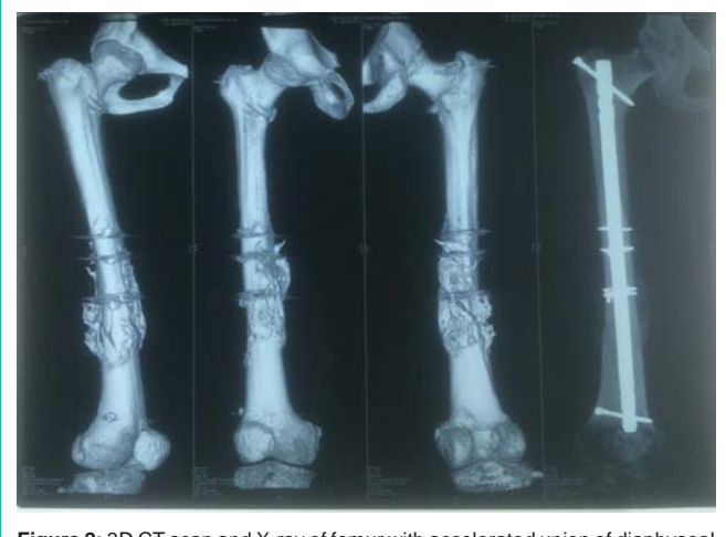
Figure 2: 3D CT scan and X-ray of femur with accelerated union of diaphyseal fracture with abundant callus formation 5 weeks post-surgery and 5.8 weeks post-injury in a group (B) patient with cervical spine fracture-dislocation and quadriplegia.

The mean time to union in of the diaphyseal femoral fractures in group D) was 6.2 (range 3-7.7) weeks. There were no cases of nonunion of the femoral fractures in this group. The mean maximal thickness of union bridging callus was 29 (range10-48) mm. The mean healing rate was 4.7 (range 2.6-7.5) mm/week, as shown, in (Table 4 & Figure 2).