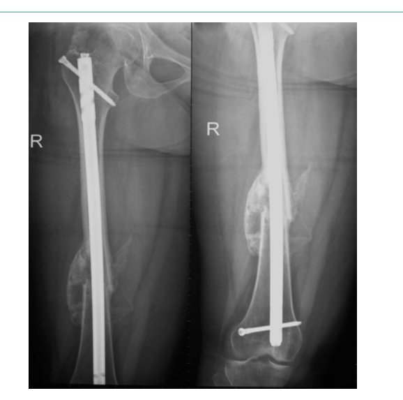
Figure 1: Showing x-ray of femur with accelerated fracture healing and abundant callus formation 5.4 weeks post-injury in a patient with severe head injury and long bone femoral diaphyseal fracture group (A) patient.

{}^{1}p = 0.001, \, {}^{2}p = 0.01, \, {}^{3}p = 0.0005, \, {}^{4}p = 0.001, \, {}^{5}p = 0.001, \, {}^{6}p = 0.005