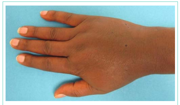
Figure 3A: AP view of the right hand 1 month after acyclovir extravasation.