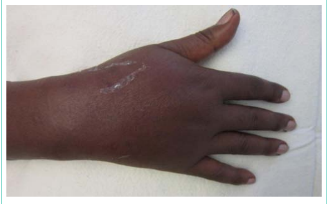
Figure 2A: AP view of the right hand 24 hours after acyclovir extravasation.

Extravasation is defined as the leakage and spread of intravenous