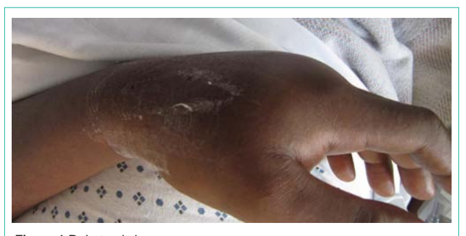
Figure 1 B: Lateral view.

discrimination was 3mm in all digits and the thumb and capillary refill was less than 2 seconds in all digits with a 2+ radial pulse. The right upper extremity was placed in a skyhook (hand placed in a stockinette which was tied to an IV pole to keep the upper extremity elevated) and his hand compartments were evaluated every 2 hours for the first 24 hours. The hand was wrapped in webril and cold compresses applied 4 times a day for 15 minute intervals. The patient was consented for possible emergent surgery in case his symptoms acutely worsened.