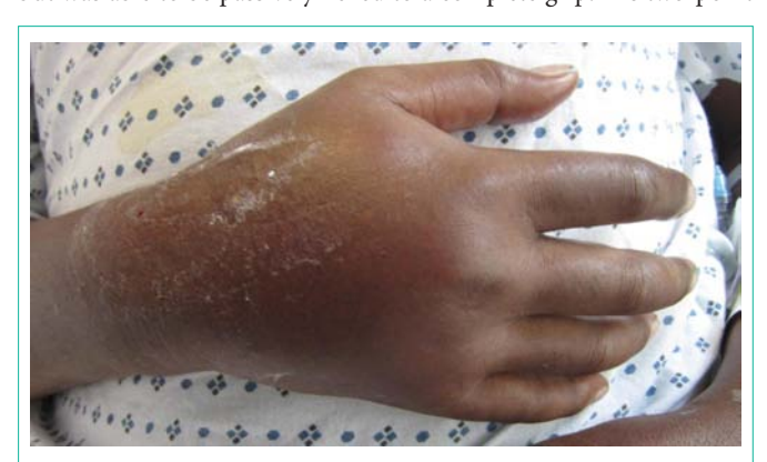
Figure 1A: AP view of the right hand after cessation of the acyclovir extravasation.

The orthopaedic hand service was consulted approximately 2 hours following extravasation of 150mL of IV acyclovir into the dorsum of the right hand on hospital day 2. Examination of the right hand demonstrated diffuse swelling that was firm but compressible. No apparent skin breakdown or necrosis was noted (Figure 1A & 1B). The patient denied pain with passive stretch of his digits. The patient was unable to fully flex his fingers secondary to the swelling but was able to be passively flexed to a complete grip. His two-point