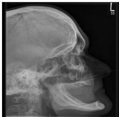
Figure 1: A lateral plain film radiograph was taken.

After examining the manufacturer's brochure for the Bridle NG tube we concluded that the wire corresponded to the flexible guide wire that is used during the insertion, but should be removed prior to fixation of the bridle. This guide wire had incorrectly been pulled through the right nasal cavity, passing around posterior to the Vomer