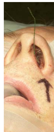
Figure 2: The patient was taken the theatre for removal under general anaesthetic.