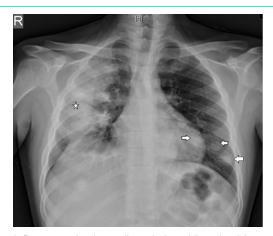
Figure 1: Posteroanterior chest radiograph shows bilateral nodular opacities (arrows) more discretely seen on left side in retrocardiac and lower zone region and a large consolidation on right side (star).

Fiberoptic nasopharyngolaryngoscopy showed ulcerated growth of left pyriform sinus and aryepiglottic fold and had subsequent biopsy of this lesion revealed epithelial hyperplasia with extensive ulceration. He also underwent skin biopsy from right leg showed leukocytoclastic vasculitis. In view of significant cough, he had a chest radiograph in the beginning which revealed bilateral lung "infiltrates" (Figure 1) and subsequently CT (computed tomography) neck, thorax and abdomen was requested to further characterize the supraglottic and lung lesions. CT (Figure 2, 3 & 4) showed left pyriform sinus mass, bilateral lung nodules, splenic lesion and renomegaly. Based on these findings he underwent transbronchial biopsy of right lung showed vasculitis with focal granulomatous inflammation, WG is a possibility. In view of haematuria and proteinuria he had renal biopsy showed mild mesangial proliferation with tubular necrosis. Based on above findings finally a diagnosis of granulomatosis with polyangiitis (WG) with pulmonary, nasal, pharyngeal, renal and dermatological involvement was made and the patient was started on oral cyclophosphamide and prednisone. He was also started on oral