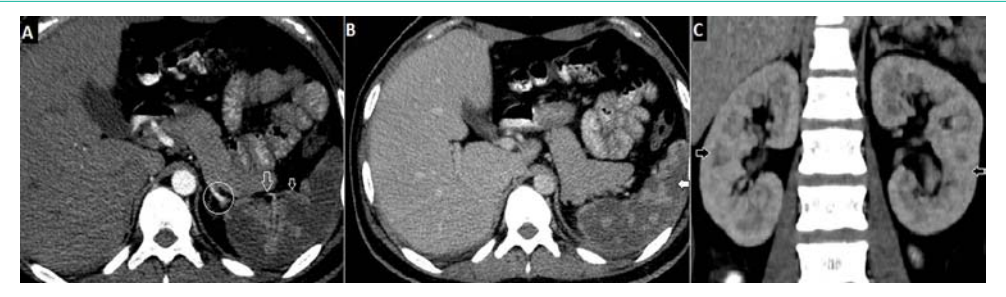
Figure 4: A, arterial phase axial, B venous phase axial and & C, coronal contrast enhanced CT sections of upper abdomen reveal normal proximal (circle) splenic artery posterior to pancreas. However, distal artery and branches at the hilum are attenuated (arrows); a large non-enhancing portion of spleen in image B (arrow) with nodular areas of spared normal enhancing splenic tissue. Bilaterally enlarged kidneys (arrows) seen in image C.

fluconazole for oral candidiasis, losartan for proteinuria and other supportive medications for symptomatic relief. He had also received pneumococcal and influenza vaccination and discharged.