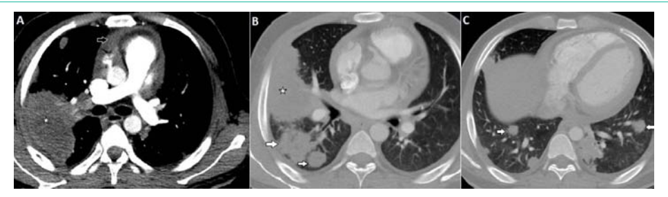
Figure 3: A, mediastinal window, B & C, lung window axial contrast enhanced CT sections of chest confirms plain radiographic findings. A mass like consolidation is seen in the right middle and lower lobes (star) and bilateral lower lobes nodules (arrows). Note the pericardial effusion (open arrow) in A.