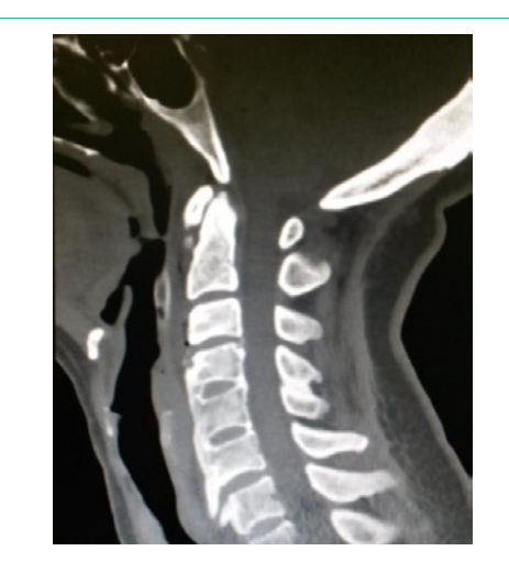
Figure 4: Postoperative CT.

spondylitis, Diffuse Idiopathic Skeletal Hyperostosis (Forestier's disease) and hereditary multiple exostoses [4,8].