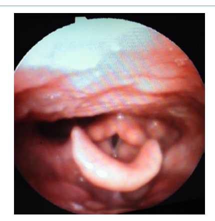
Figure 3: Postoperative FNF.

Changes in the cervical spine can cause dysphagia, trismus and dyspnea due to direct pressure of the neck structures. In literature, there are few similar cases reported and among the changes already described are: Osteophytes by degenerative joint disease, ankylosing