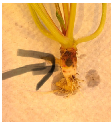
Figure 4: Symptoms on sugar beet roots inoculated artificially with A. alternata .

for Ion Torrent ™ for sequencing in Ion Torrent ™ Personal Genome Machine ™ System. The sequencing data were BlastX searched against an updated NCBI non-redundant database utilizing the high-throughput alignment program DIAMOND. A microbiome analysis tool MEGAN Community Edition v6.12.3 was then used to assess the blastX results and this confirmed to be A. alternata