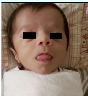
Figure 1: The clinical picture describing macroglossia, flat face and flat nasal bridge.

Catch up in length to just above the 3 rd centile (length 62 cm), improvement in axial tone albeit not total, improvement in the stool frequency, normalisation of FT4 & rT3, persistently elevated FT3, suppressed TSH and decrease in CK levels have been noted over the 6 months duration of follow up subsequently on thyroxine, though the results of evaluations using Bayley Scale of Infant and Toddler Development (BSID) 4 indicate neurodevelopmental delay.