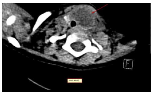
Figure 3: CT scan neck axial and sagittal view showing abscess.

day of antibiotic treatment, but thyroid USG repeated after 5 days of antibiotics showed slightly increased collection of pus. So, decision was made to do surgical drainage under general anesthesia. The patient received PRBC transfusion before the procedure. 10 ml of pus was removed by incision and drainage. A drain was inserted during the procedure which was removed 2 days later. The culture of the fluid grew Eikenella Corrodens , sensitive to ceftriaxone. The patient improved symptomatically and antibiotics were discontinued and the patient was discharged 3 days after the procedure. Steroids were tapered and stopped 1 week post discharge. The child was reviewed 1 week later and was clinically well. The Repeat CBC showed normal WBC, Hb 10.5 g/dl, platelets 507 x10 9 /L, ESR-22 mm/hr, CRP- 0.5 mg/L. The repeat free T4 was normal 13.4 p mol/L, free T3- 5.45 pmol/L and TSH- 1.86 m IU/L.