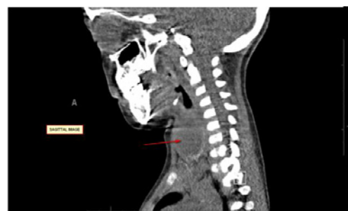
Figure 2: CT scan neck axial and sagittal view showing abscess.