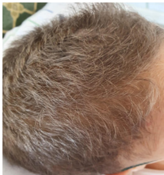
Figure 1: Silvery gray Hair on the scalp having a metallic sheen.