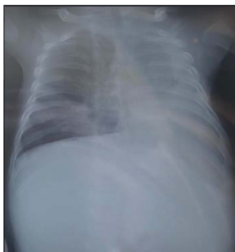
Figure 3: Chest X-ray showing a left pleural effusion and an atelectasis of the left lung.