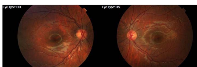
Figure 2: Fundoscopy of both eyes, showing a greater cup-disk ratio on the LE.