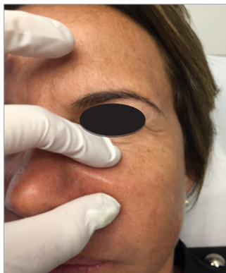
Figure 2: Palpation of the inflammatory nodules in the malar region.