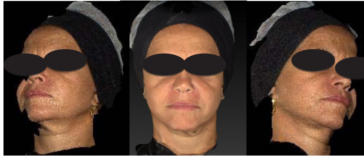
Figure 4: The patient before treatment, in the photos above, The patient after the treatment, in the photos below. In the first photos, showing inflammatory nodules in the malar region and nasogenian sulcus. In the latest photos, there's an improvement of the lesions, but the non inflammatory nodules in the nasolabial sulcus are still present.

procedure with hyaluronic acid. In this case, the hypothesis of systemic infection was excluded after the clinical history and the laboratory research. The new procedure with the use of hyaluronic acid may have served as a trigger for the development of this systemic reaction, as already mentioned in the literature.