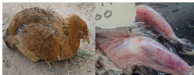
Figure 1: Ruffled feathers in a depressed and Haemorrhages on thigh and leg muscles of an indigenous chicken pullet suffering from infectious bursal disease [54].

The clinical signs of IBD vary considerably from one farm, region, country or even continent to another [79]. In acute form, birds are prostrated, debilitated, dehydrated, with water diarrhea and swollen vents stained with faeces. In birds below three weeks, the disease is asymptomatic, but birds have bursal atrophy with fibrotic or cystic follicles and lymphocytopenia before six weeks and are usually susceptible to other infections that would be contained in immunocompetent birds [54] (Figure 1).