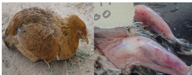
Figure 1: Ruffled feathers in a depressed and Haemorrhages on thigh and leg muscles of an indigenous chicken pullet suffering from infectious bursal disease [54].

The clinical signs of IBD vary considerably from one farm, region, country or even continent to another [79]. In acute form, birds are prostrated, debilitated, dehydrated, with water diarrhea and swollen vents stained with faeces. In birds below three weeks, the disease is asymptomatic, but birds have bursal atrophy with fibrotic or cystic follicles and lymphocytopenia before six weeks and are usually susceptible to other infections that would be contained in immunocompetent birds [54] (Figure 1).