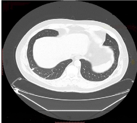
Figure 3: Final CT scan.

signs of pulmonary embolism. The CT image was ambiguous - both inflammatory and proliferative (Figure 2). Levofloxacin was used empirically at a dose of 500 mg per day for 10 days. In a follow-up CT examination after 4 weeks, there was a partial regression (to 6 mm) of the consolidation area in the ninth segment of the right lung (Figure 3).