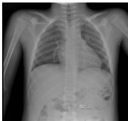
Figure 1: The foreign body in the stomach.

A 9 years old boy came to the Emergency Department for referred ingestion of a metal crucifix. The first X-ray of the abdomen (Figure 1) documented the foreign body (maximal longitudinal Ø 3 cm x 1,5 cm) into the gastric antrum, at the level of left transverse apophysis of L3. After 12 hours fasting, the removal through endoscopy failed because of the presence of a big amount of food into the stomach. The second abdomen X-ray after 16 hours demonstrated the presence of the metal crucifix into the right iliac fossa (Figure 2). The crucifix was expelled 3 days later without damage. Peculiar in this case is the autonomus expulsion of the foreign body. In fact in case like this usually the endoscopic removal enters in the emergency maneuvers. The children digestive tract in fact has a diameter that doesn't allow to such big foreign body to pass through.