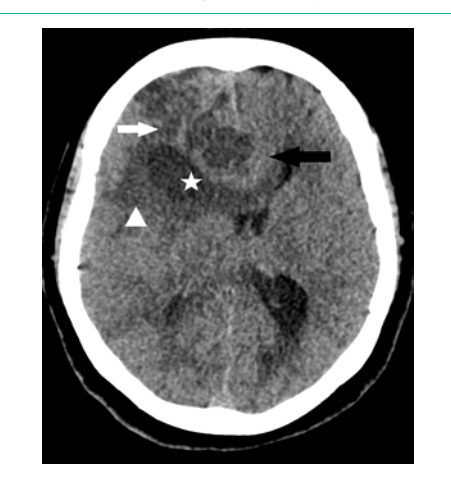
Figure 1: Axial Computed Tomography (CT) image of the head without intravenous contrast show hypodense mass in the right frontal region (white arrow), with a cystic component (asterisk), perifocal oedema (head of arrow) and associated mass effect with subfalcine herniation (black arrow).

Some theories on the pathogenesis of cystic lesions are described