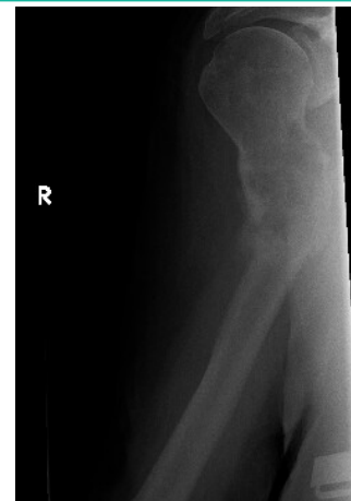
Figure 4: Bridging callus seen the day prior to surgery.