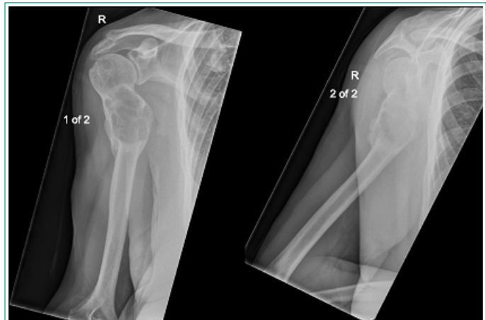
Figure 6: Most recent follow-up, 14 months after initial presentation.

He went on to have a staging CT which showed no local recurrence in his remaining kidney, nor any other suspicious lesion to suggest a separate primary pathology. This was followed by an MRI of his right upper arm, which was thought to be most likely in keeping with a renal cell metastasis. A bone scan was also carried out and showed no other involved areas. Serial radiographs were carried out of his right humerus. Figure 3 shows the fracture almost 12 weeks after initial presentation (whilst the patient was still symptomatic) and Figure 4 shows the lesion the day before his planned surgery when he was no longer symptomatic. This radiograph showed progressive callus formation and that his pathological fracture was on the way to uniting. Figure 5 shows the asymptomatic lesion at nearly 6 months after his initial presentation and Figure 6 shows the lesion at most recent follow up 14 months after his initial presentation when he was discharged from the Orthopaedic Oncology service.