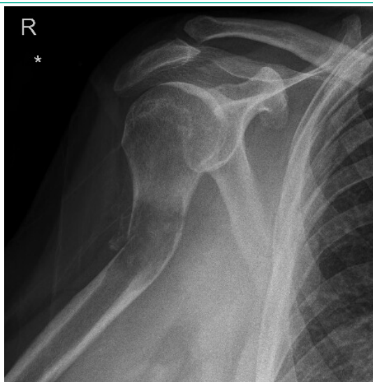
Figure 2: Radiograph from initial presentation to referring hospital.