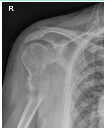
Figure 3: Fracture almost 12 weeks after initial presentation.