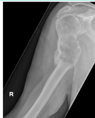
Figure 5: Follow-up at almost 6 months after initial presentation.