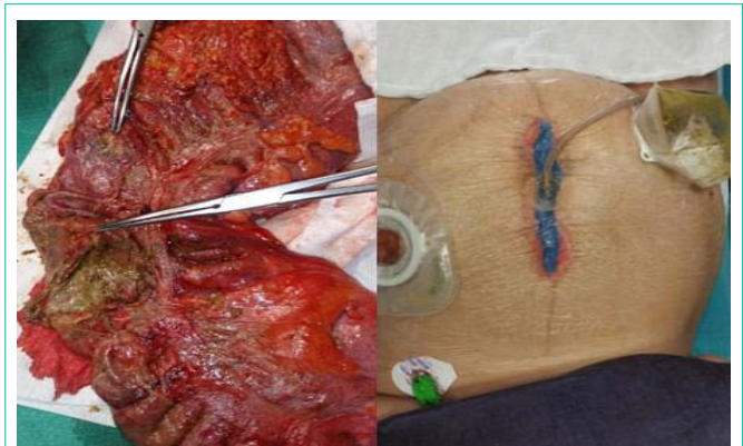
Figure 2: Right hemicolectomy material with 4-5 cm ischemic/perforation area and abdominal wall closure using the Vacuum Assisted Closure (VAC) for evisceration and skin defect.

In this case, conservative management with which corrections of the fluid, electrolyte balance and nasogastric suction were not adequate