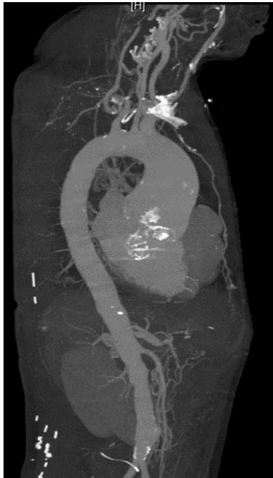
Figure 2: Preoperative CT angiography. CT angiography revealed a 60-mm ascending thoracic aortic aneurysm and 66-mm dilated aortic root.