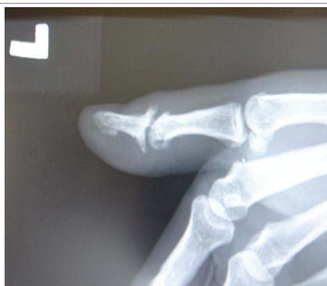
Figure 5: Post-operative radiograph of left thumb at 1 year post-operatively.

with satisfactory results. In a case series, the average retained range of motion was 33 degrees with satisfactory stability but 10 degrees extension lag [3]. Theoretically, silicone interpositional arthroplasty of DIPJ achieves less pinch power than arthrodesis, although further studies are needed to validate this. Total joint replacement for DIPJ arthritis, though not commonly performed, remains one of the options for treatment. Sierakowski reviewed 131 patients with distal interphalangeal joint arthritis treated by total joint replacement. The patients can achieve a greater range of 39 degrees with the same degree of extension lag. Complications rate was 5% in terms of cellulitis, osteomyelitis, instabilities and deformities [4].