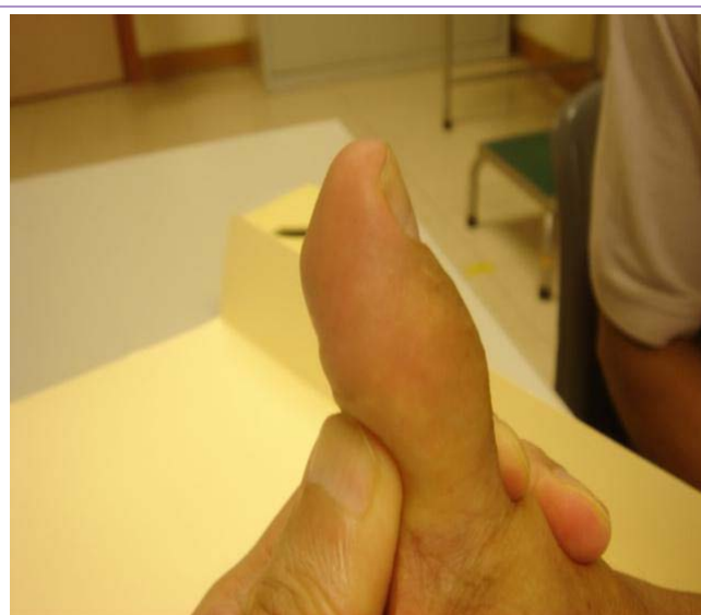
Figure 4: 5 degrees of extension lag at one year post-operatively.