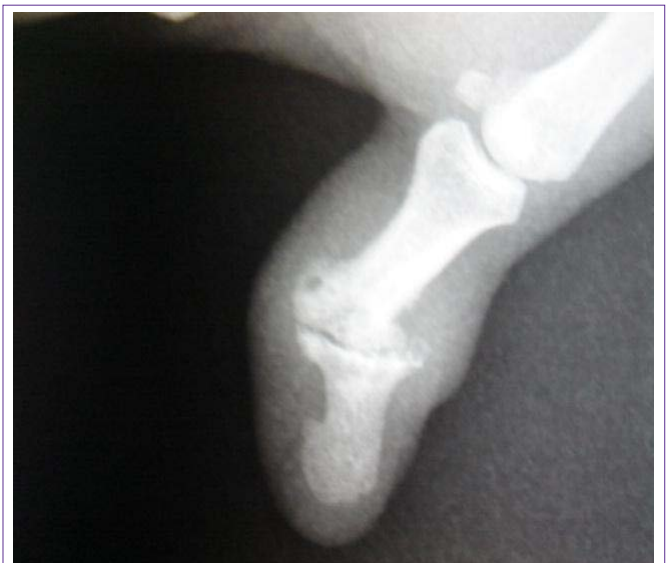
Figure 1: Pre-operative radiograph of left thumb interphalangeal joint showing the deformity.

Surgical treatment for the arthritis of the distal interphalangeal joint (DIPJ) includes arthrodesis and silicone interpositional arthroplasty. For DIPJ arthrodesis by Kirschner wire, cerclage wire or Herbert screw, major complications (non-union, malunion, infection) occurred in 20% of patients, while minor complications (skin necrosis, cold intolerance, proximal interphalangeal joint stiffness, superficial wound infection, or prominent implant) occurred in 16% of patients [1]. One study showed only 4% non-union rate with oblique placement of an AO lag screw [2]. Silicone has been the traditional material used in interpositional arthroplasty for years