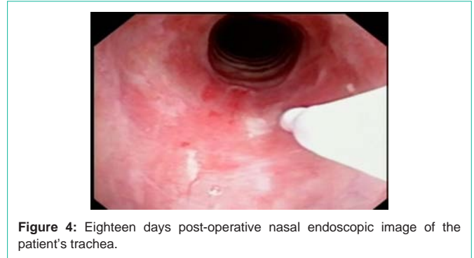
Figure 4: Eighteen days post-operative nasal endoscopic image of the patient's trachea.

performed an in office bronchoscopy under local anesthesia. He noted a scar band along the medial aspect of the right main stem only minimally projecting into the lumen. She was referred to our interventional pulmonologist who performed a bronchoscopy under general anesthesia confirming the webbing of the right main stem bronchus, as well as minimal webbing in at the right upper lobe take off. Balloon dilation of the right main stem bronchus was performed with immediate improvement. At the time of the bronchoscopy the gastroenterologists performed an endoscopy and Bravo pH study to determine if gastroesophageal reflux was potentially the cause of her subglottic stenosis. The results indicated a normal amount of acid reflux in the distal esophagus. Additionally, laboratory tests for lupus and Wegener's granulomatosis were negative. The only identified risk factor for subglottic stenosis was her prior intubation although thought to be unlikely given the brevity of the operation. The subglottic stenosis was labeled as idiopathic. She will continue to have follow-up visits with the laryngologist until one year post-op and thereafter return only if symptoms of dyspnea or stridor reoccur.