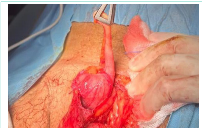
Figure 2: Preoperative picture showing acute inflammation of the appendix incarcerated in a right inguinal hernial sac (Amyand's hernia).

At the time of surgery, an Amyand's hernia was discovered, accompanied by inflamed appendicitis (Figures 1,2). No other abdominal abnormalities were identified during the preoperative work-up. Appendectomy was performed successfully, and the patient recovered without postoperative complications.