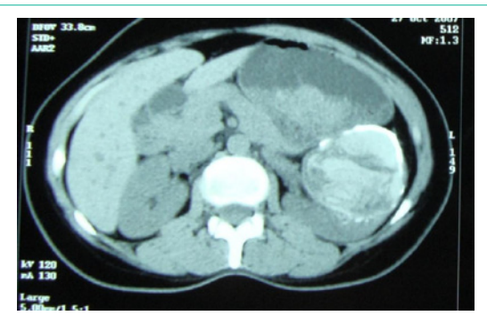
Figure 1: Computerized tomographic image showing the mixed density lesion with calcification with adjacent compressed renal parenchyma.

Epidermoid cysts of the kidney are extremely rare, unlike their