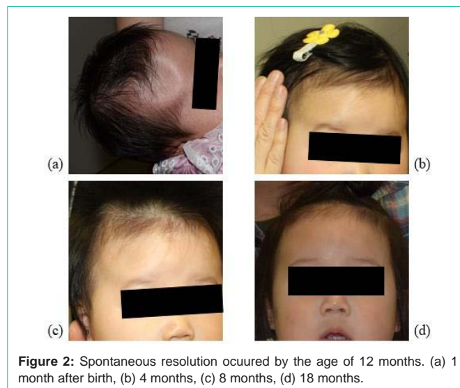
Figure 2: Spontaneous resolution occurred by the age of 12 months. (a) 1 month after birth, (b) 4 months, (c) 8 months, (d) 18 months.

We considered the use of cranial molding therapy with an orthotic helmet as a good non-surgical approach. Before starting helmet therapy, we needed to wait for a several months until she was able to