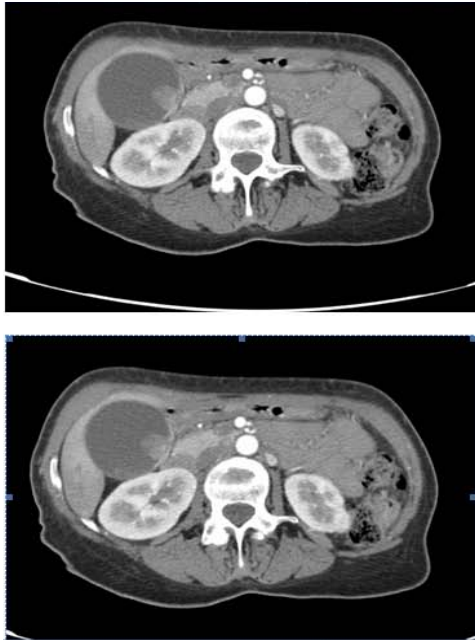
Figure 1: Computed Tomography Angiography showing an exophytic lesion arising from a focally thickened and irregular medial wall of the gallbladder body with areas of wall disruption. The mass measures approximately 2.0 x 1.8cm. Localized peri-portal and aortic lymph node enlargement is noted within the region.

resonance cholangiopancreatography (MRCP) has evolved into a single noninvasive imaging modality that allows for complete assessment of loco regional involvement.