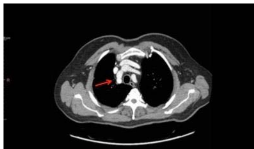
Figure 1: Chest CT showing an aberrant brachiocephalic artery (red arrow).

A 70-year-old man was admitted to our operative unit for treatment of non-small cell lung cancer located in the right upper lobe. Pre-operative chest computed tomography scan showed a tortuosity of the brachiocephalic artery that crossed horizontally the right anterolateral surface of the trachea before ascending (Figure 1). The vascular anomaly was then identified intraoperatively during the lymph node dissection in the Baretty's space (Figure 2). Thoracic surgeons must be aware that an unrecognized anomalous origin of the brachiocephalic artery can lead to haemorrhagic complications during mediastinal lymph node dissection due to vascular injury.