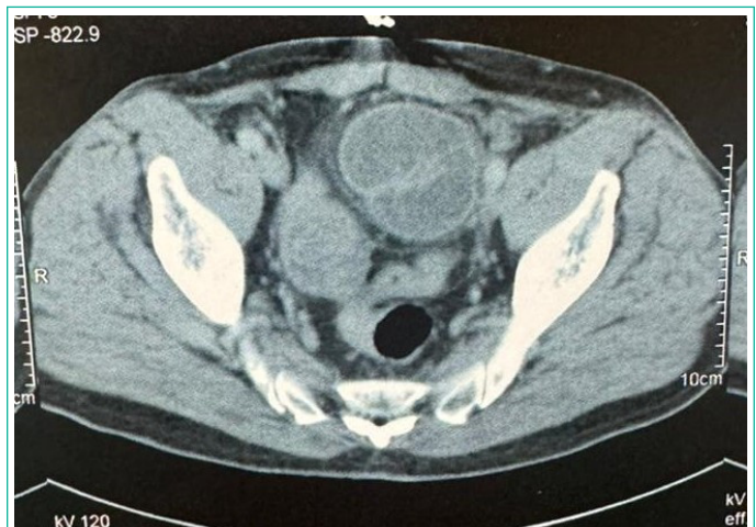
Figure 1: Abdominopelvic CT scan indicated small bowel distension measuring 42 mm with hydroaeric levels, with areas of disparity in the caliber of distended and flattened small bowel in contact with the bladder.

Initially, the decision was to manage the patient conservatively in hopes of spontaneous resolution of the obstruction, but due to its persistence, a decision was made for surgical ex-