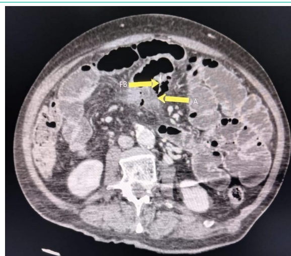
Figure 1: Axial view of CECT abdomen shows fishbone [FB] and abscess [A].

jejunum, 150 cm from the ligament of Treitz. Localized inflammation and abscess formation were noted, prompting a segmental resection of the affected bowel. The remainder of the intestine appeared grossly normal except for the perforation site, and end-to-end anastomosis was performed manually. The patient experienced no complications during the postoperative period and was discharged after eight days. A retrospective history taken postsurgery revealed that the patient had consumed fish seven days prior to admission.