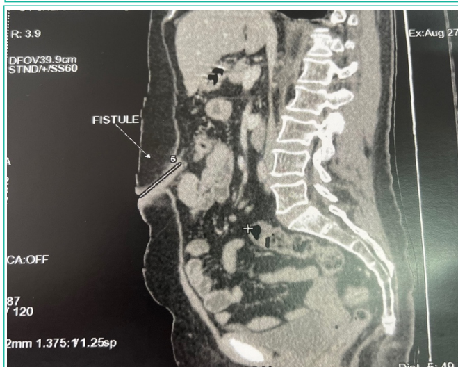
Figure 3: Active fistulous tract in the left paraumbilical region extending deeply into the preperitoneal space, measuring 7 mm in caliber and approximately 5 cm in length, along the pathway of the laparoscopic trocar. This is suggestive of a post-laparoscopy parietal fistula.

While clips are safe and widely used, improper application or technical issues can lead to serious complications, such as intra-abdominal abscesses, especially if the clips become infected or irritate surrounding tissues.