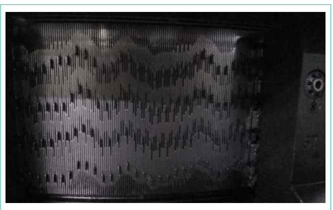
Figure 2: Practical view of four-butt needle.