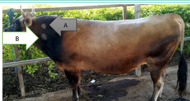
Figure 2: Bovine tuberculosis injection site (A) Avian Tuberculin (AT) and (B) Bovine Tuberculin (BT) and its reactions.