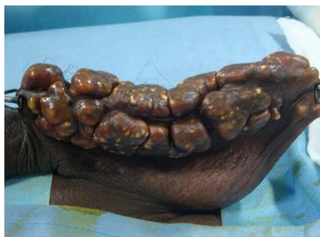
Figure 2: Cystic lesions over the Scrotum.