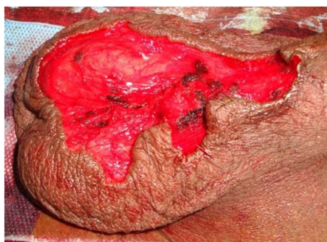
Figure 3: Excision of the scrotal lesion done.

examination, asymptomatic multiple smooth yellow and skin-colored cystic nodules were palpable on the whole scrotum, there were no central punctum; however, no lesions were detected in other locations, including the trunk, extremities, and face. The diameters