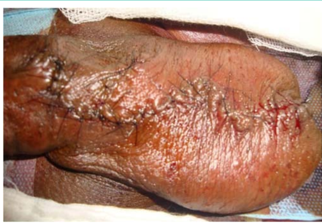
Figure 4: Primary closure after excision of lesion.

of the lesions ranged from 1cm to 3 cms (Figure 1,2). There were no signs of inflammation in any of the lesions. The patient's past and family histories were non-contributory. The results of laboratory blood tests did not show any evidence of infection or inflammation. Patient underwent excision of lesions en-mass (Figure 3) under spinal anaesthesia and primary closure was done (Figure 4) and specimen sent for histopathology. Subsequent histopathological examination revealed cysts within the lower dermis and subcutaneous fat. The folded cystic wall was lined with stratified squamous epithelium and contained flattened sebaceous gland cells (Figure 5).