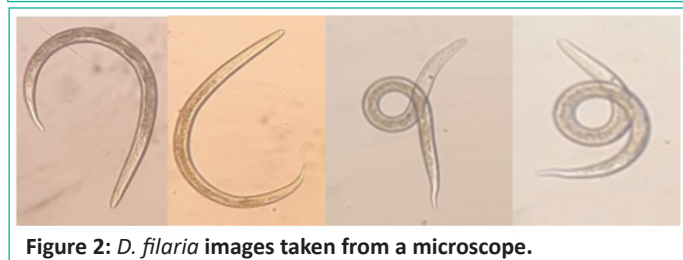
Figure 2: D. filaria images taken from a microscope.